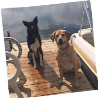
IRIS + AUGUSTA

My own dogs, Iris and Augusta, have been keeping myself, and my two daughters, active and happy. I adopted Iris from Peterborough Humane Society (PHS) in the Fall of 2018, and she has since become a key part of both my family at home and our PHS family. Thanks to supporters like you, our amazing team continues to provide animals such as Iris with the love and compassion they deserve.